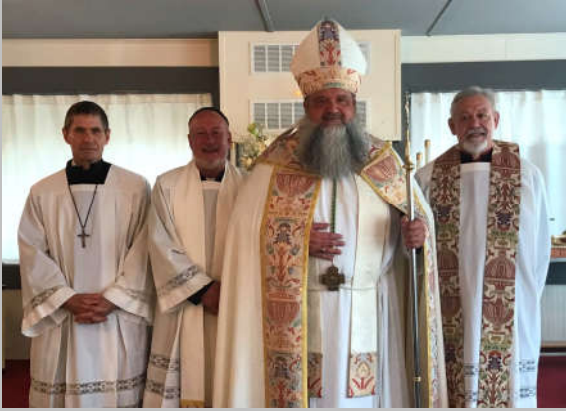
St. Augustine's Anglican Church cele- brates the opening of their new downtown location (Bryson City, NC)