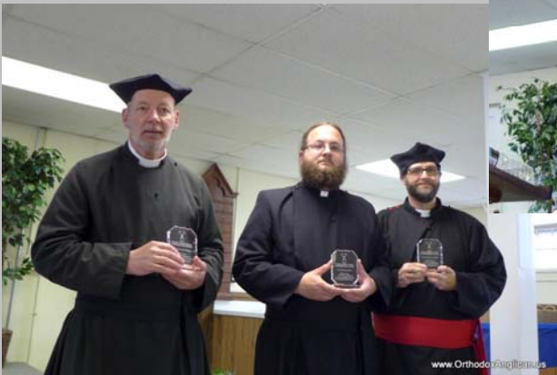
The Cornerstone Award winners