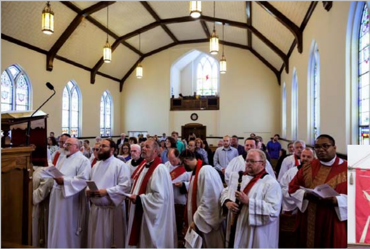
Left: The congregation at Holy Communion 6/22