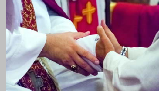
The new priests hands are anointed with oil and wrapped in a linen cloth