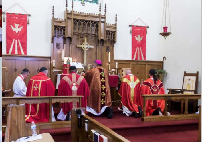
Below: Kneeling for the prayer of confession