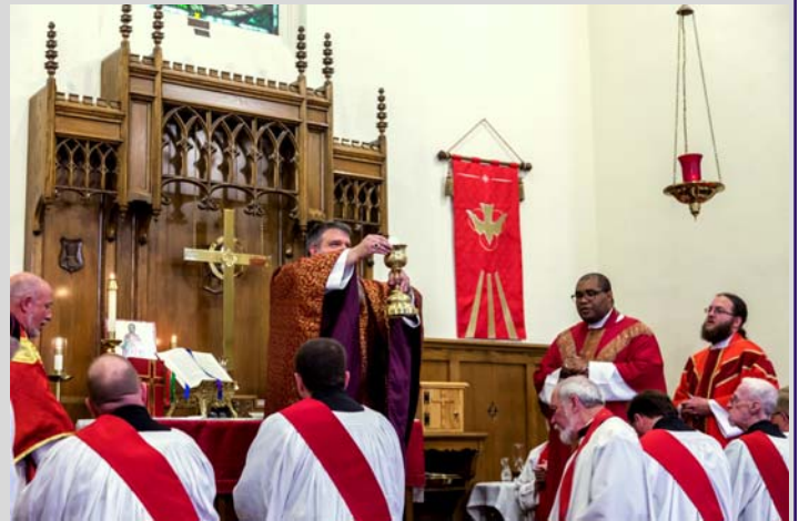
Holy Communion at General Convention June 22, AD 2018

I am pleased to report that the 54th General Convention of the Orthodox Anglican Church held on 22-23 of June in Kannapolis, North Carolina was a great success. It was well attended, we added four new priests to the jurisdiction, had great speakers, delicious food, and blessed fellowship. During the business meeting we elected a new National Council, we elected three Board members for St. Andrew's Theological College and Seminary, and we approved a budget.