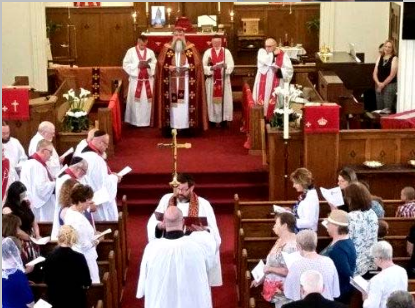
Right: The Holy Gospel is read 6/22.