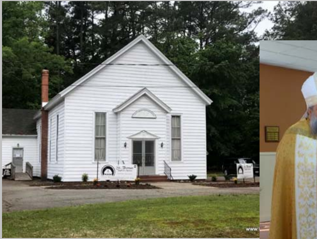
Above: St Thomas, Mobjack, VA