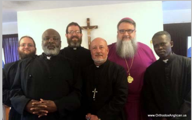
The Liturgical Seminar for Priests