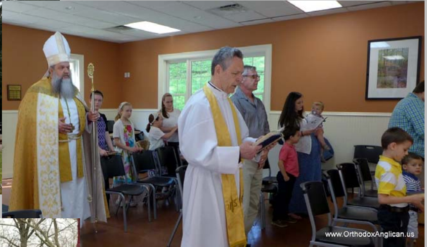
Below: Christ Church, Louisville, KY