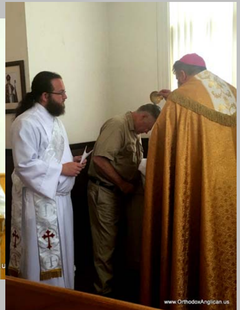
Holy Baptism, Mobjack, VA

“The Orthodox Anglican Church” and “The Orthodox Anglican Communion” are Registered with the United States Patent and Trademark Office.