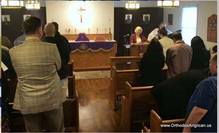
Above: Holy Week at Saint Philip the Evangelist Anglican Church, Charlotte, North Carolina

"he who honors a priest, honors Christ, and he who insults a priest, insults Christ." -St John Chrysostom