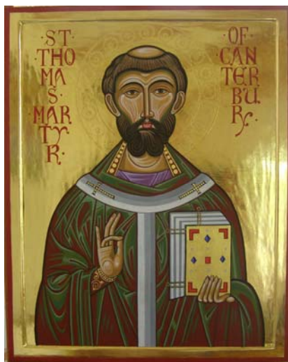
St. Thomas a' Becket, Archbishop of Canterbury, directed the regular observance of Trinity Sunday.

In our age the traditional Christian liturgy, which had served as a guardrail to preserve and promote orthodoxy, has been abandoned making it possible to attend services at an Evangelical Church and rarely if ever hear Trinitarian doctrine. What is the solution? The solution is to be found in the old paths . For literally thousands of years God's people have preserved orthodox doctrine and practice through the liturgy. Trinitarianism has always been a prominent feature of the traditional Christian liturgy. In the Orthodox Anglican Church a guardrail against error is the traditional Christian liturgy of the 1928 Book of Common Prayer. I consider the inculcation of Trinitarian orthodoxy to be a great genius of the Book of Common Prayer. The emphasis on the Holy Trinity isn't something relegated to one day in the Christian year, it is in every service in the orthodox editions of the Book of Common Prayer. Every day of the liturgical year is as it should be, devoted to honor the Holy Trinity.