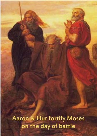
Aaron & Hur fortify Moses on the day of battle